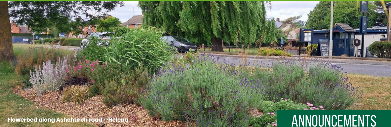
Flowerbed along Ashchurch road